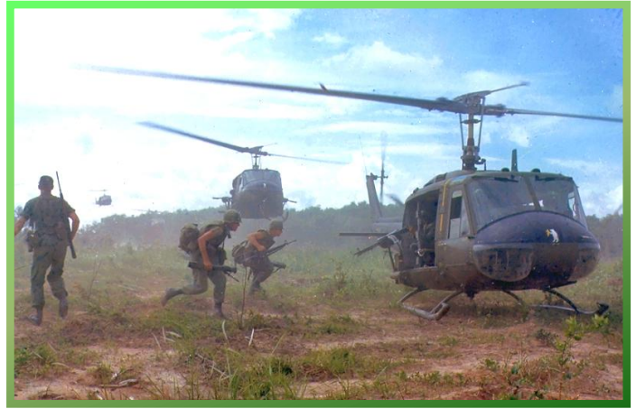
GIVING TODAY - TO THE SONS & DAUGHTERS OF THOSE WHO GAVE YESTERDAY